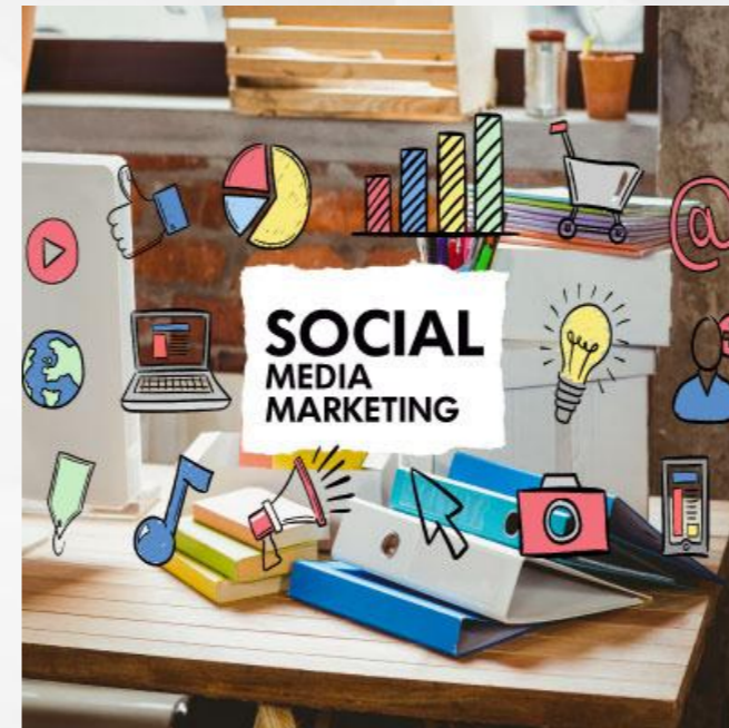
Social Media Marketing