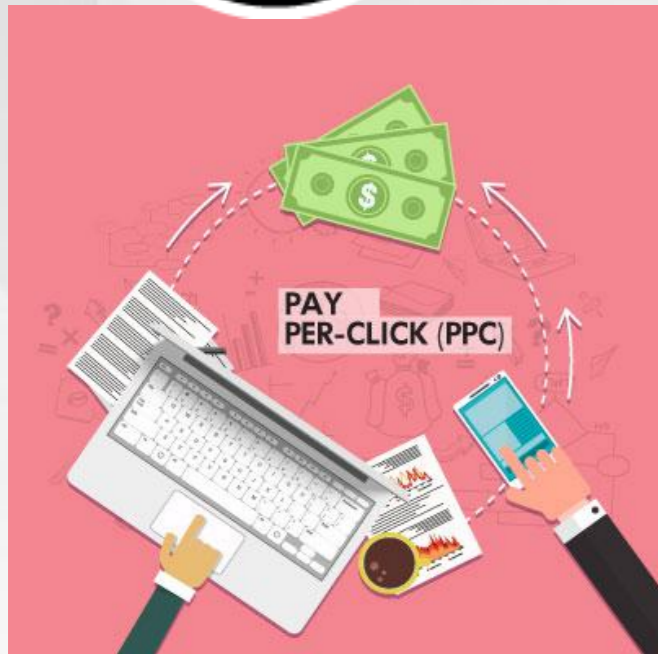
Pay per Click (PPC)